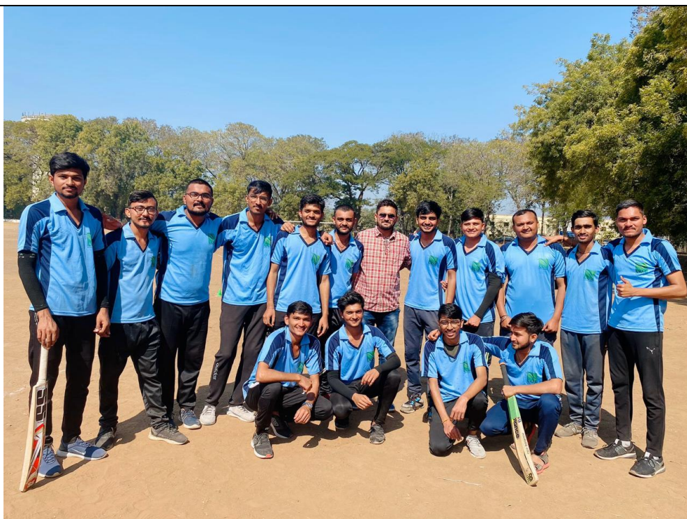
Inter Collegiate Cricket Tournament