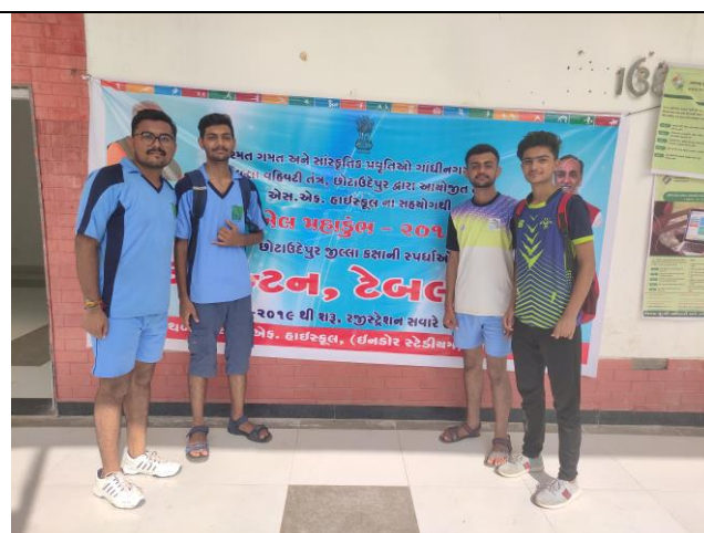
"Khel Mahakumbha- 2019-20"