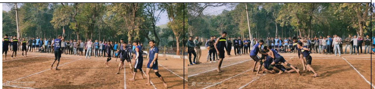
Inter Collegiate Kabaddi Tournament