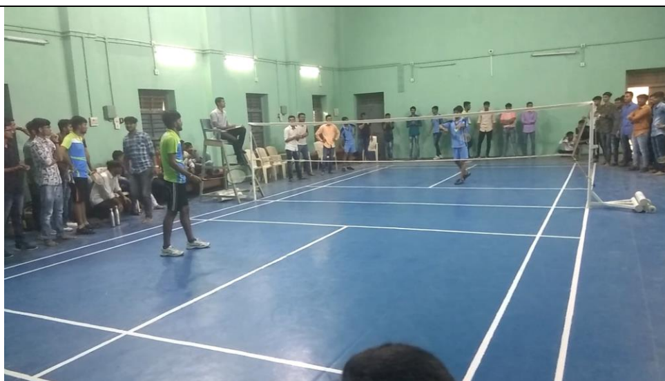
Inter Collegiate Badminton Tournament