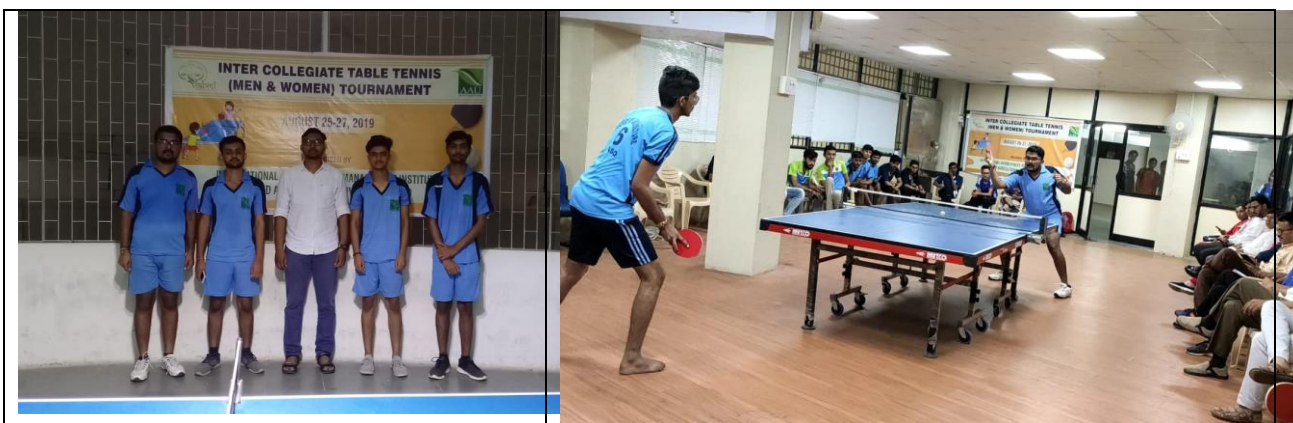
Inter Collegiate Table-tennis Tournament