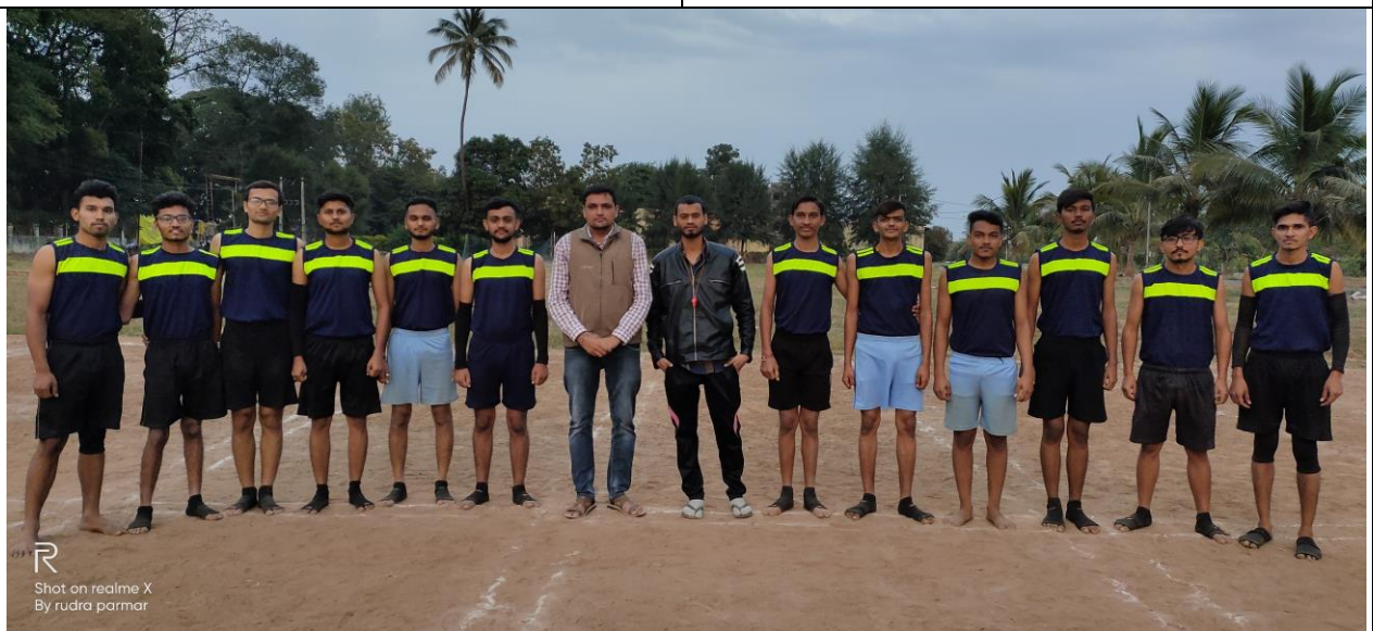
Inter Collegiate Kho Kho Tournament